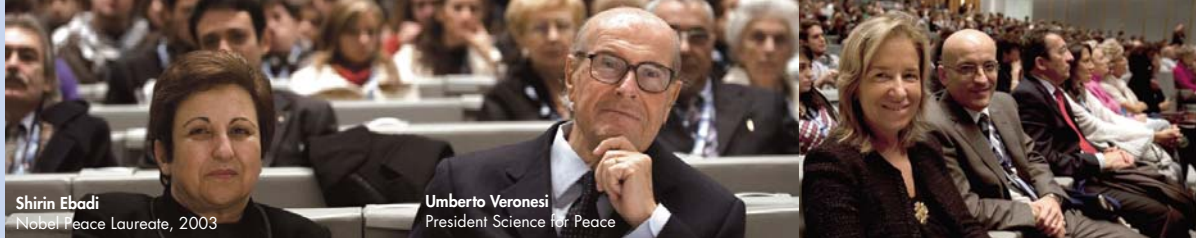
Shirin Ebadi Nobel Peace Laureate, 2003