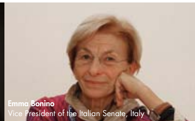
Emma Bonino Vice President of the Italian Senate, Italy